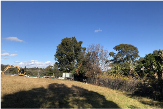
2. View towards the western boundary with Cabbage Gum in background and Claret Ash.