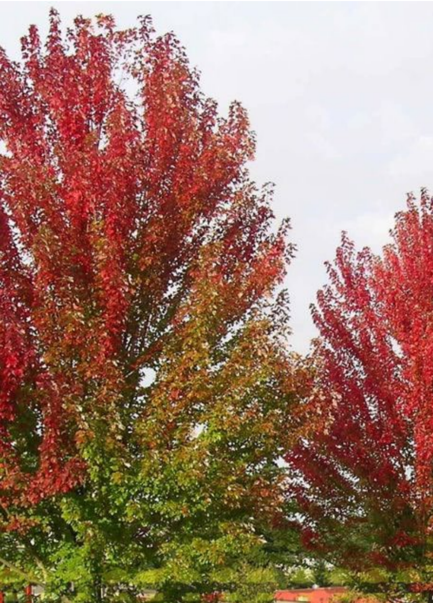
Acer freemanii 'Autumn Blaze' Maple 'Autumn Blaze'