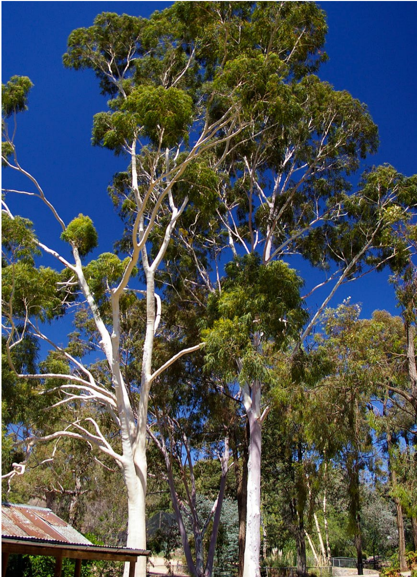
Eucalyptus citriodora Lemon Scented Gum