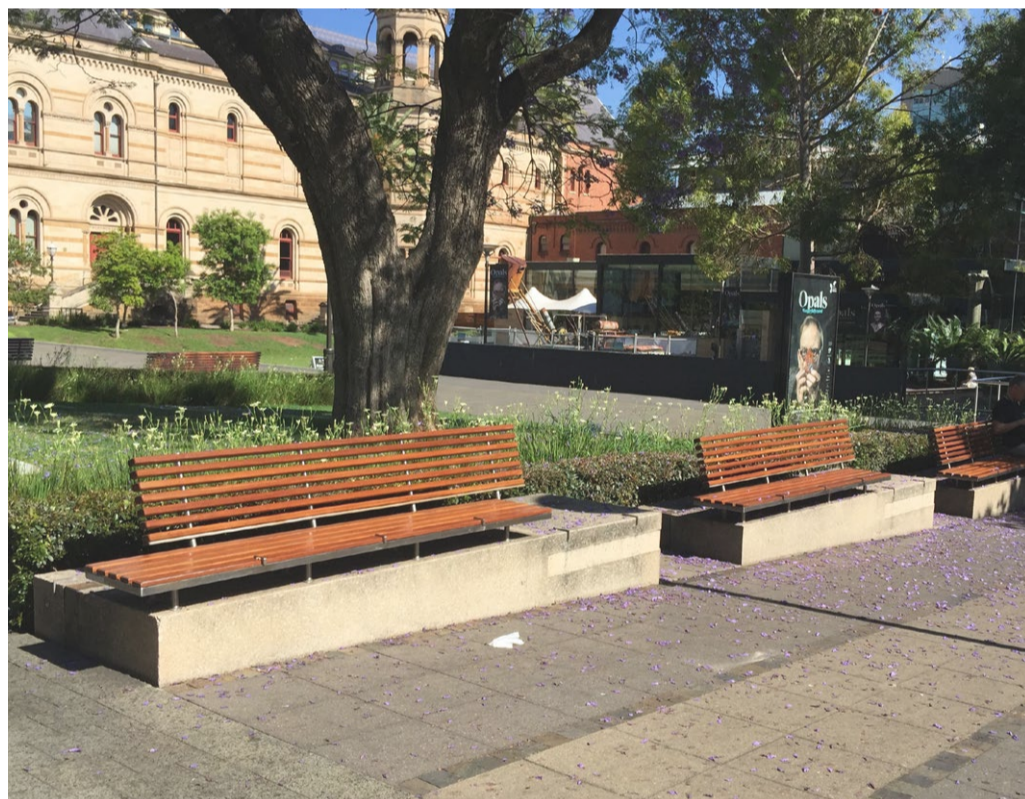
Seats in Plaza will be inviting and comfortable.