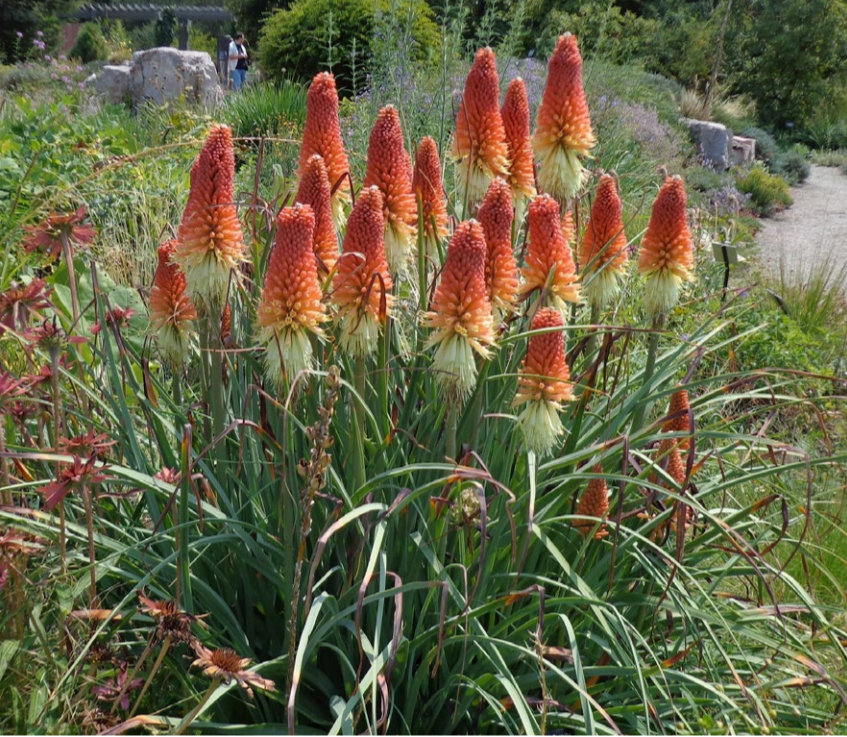
Kniphophia spp. Red Hot Poker