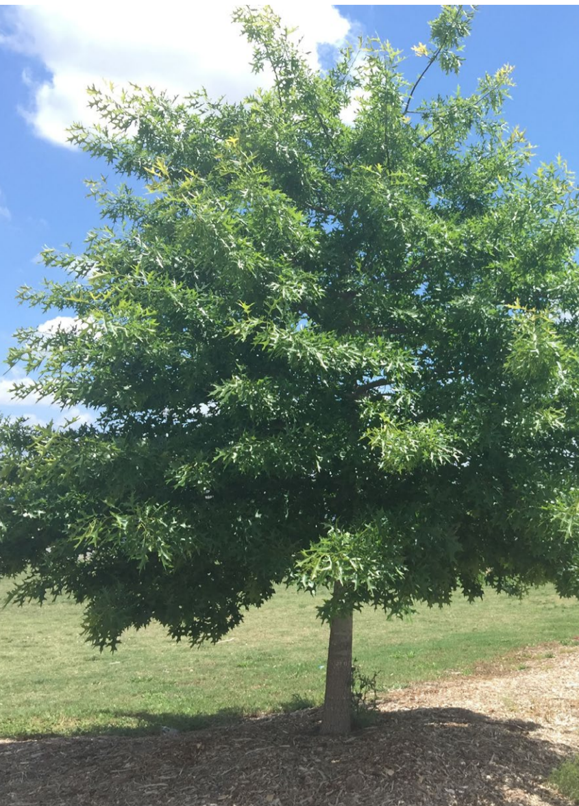
Quercus palustris Pin Oak