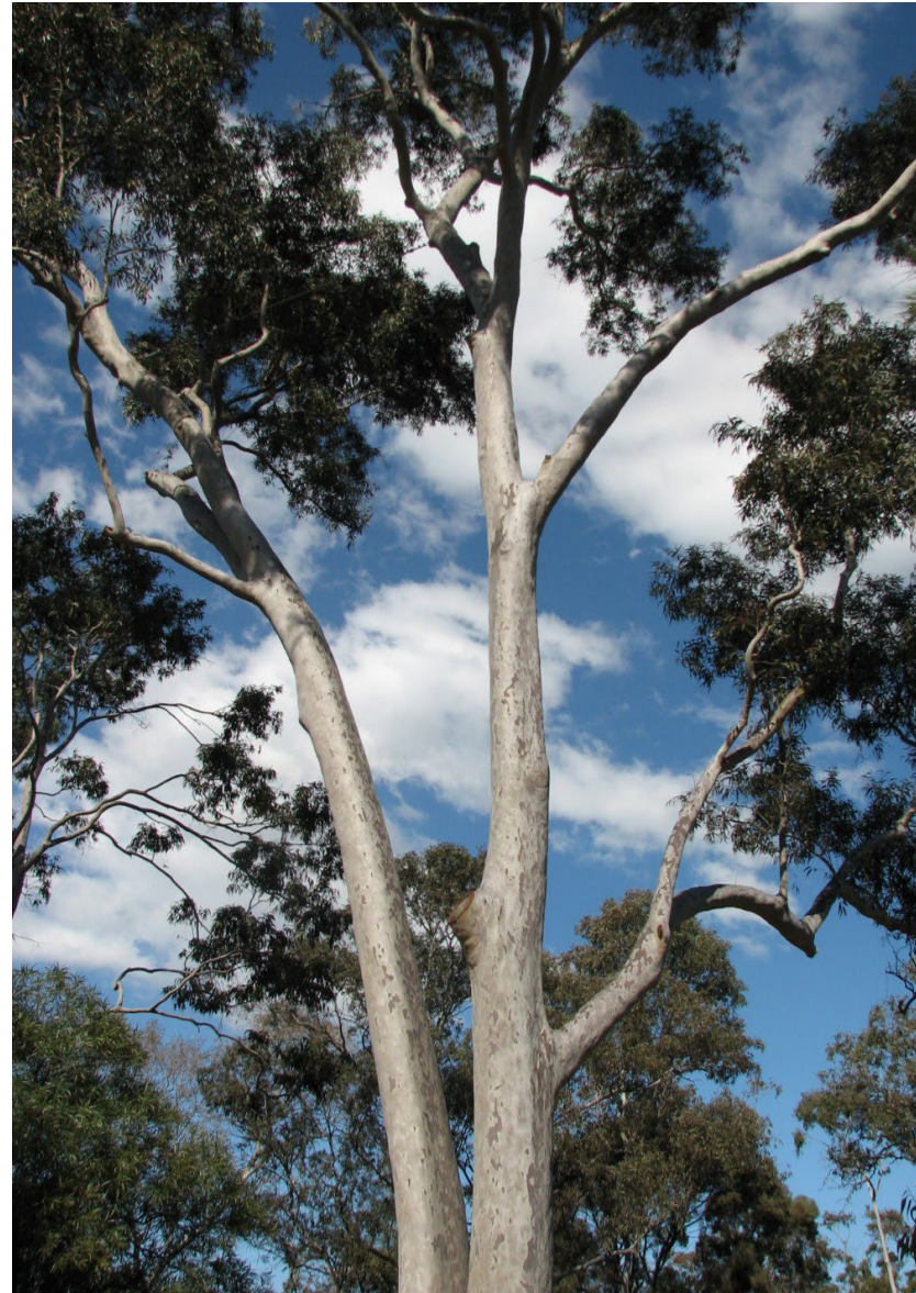
Corymbia maculata Spotted Gum