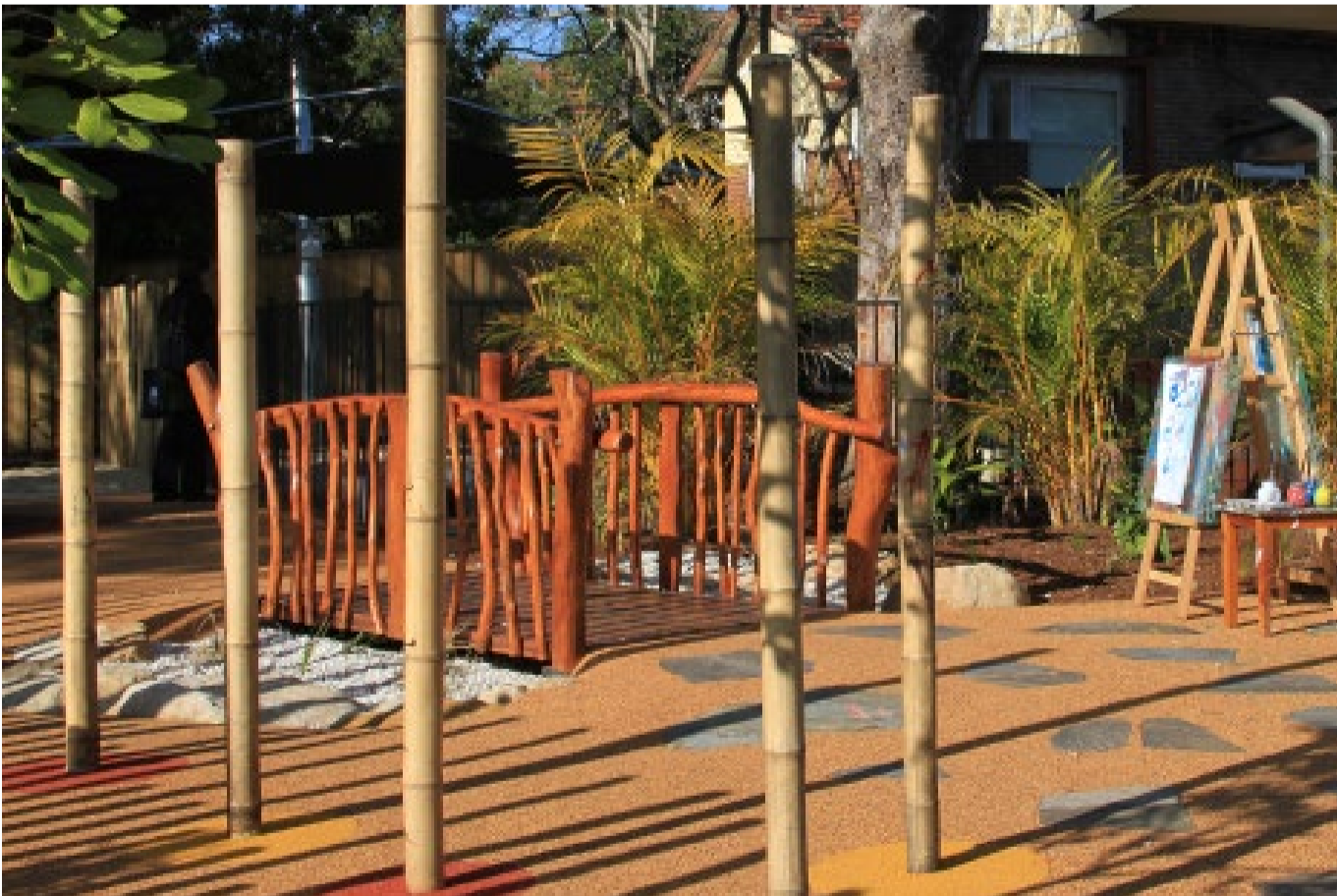
Children enjoy crossing bridges