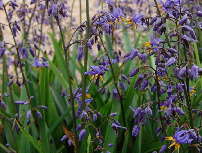
Dianella caerulea Blue Flax Lilly