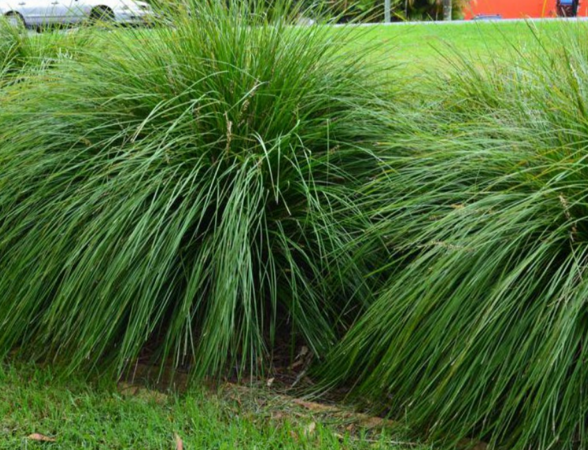
Lomandra Tanika Dwarf Lomandra