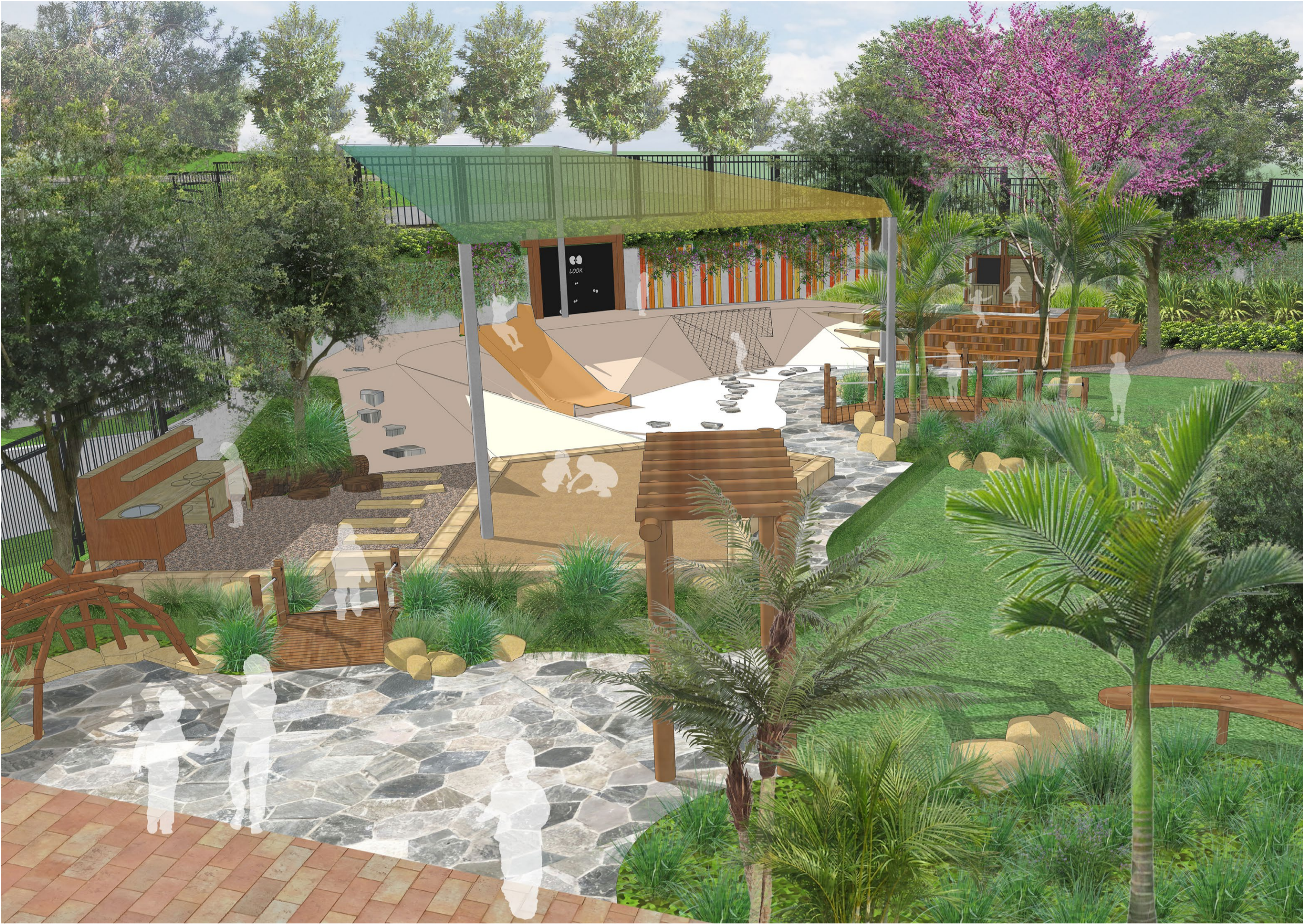
Early Learning Centre outdoor play area. View from the west side