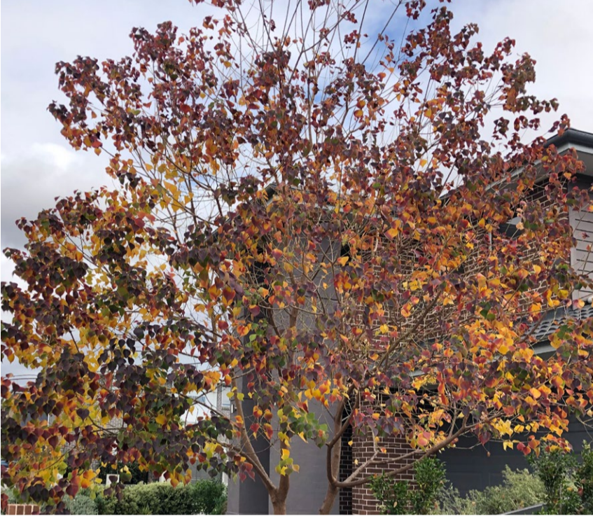
Sapium sebiferum Chinese Tallow