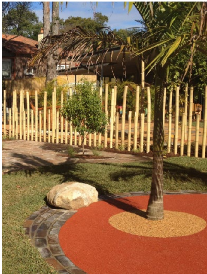
Combination of materials