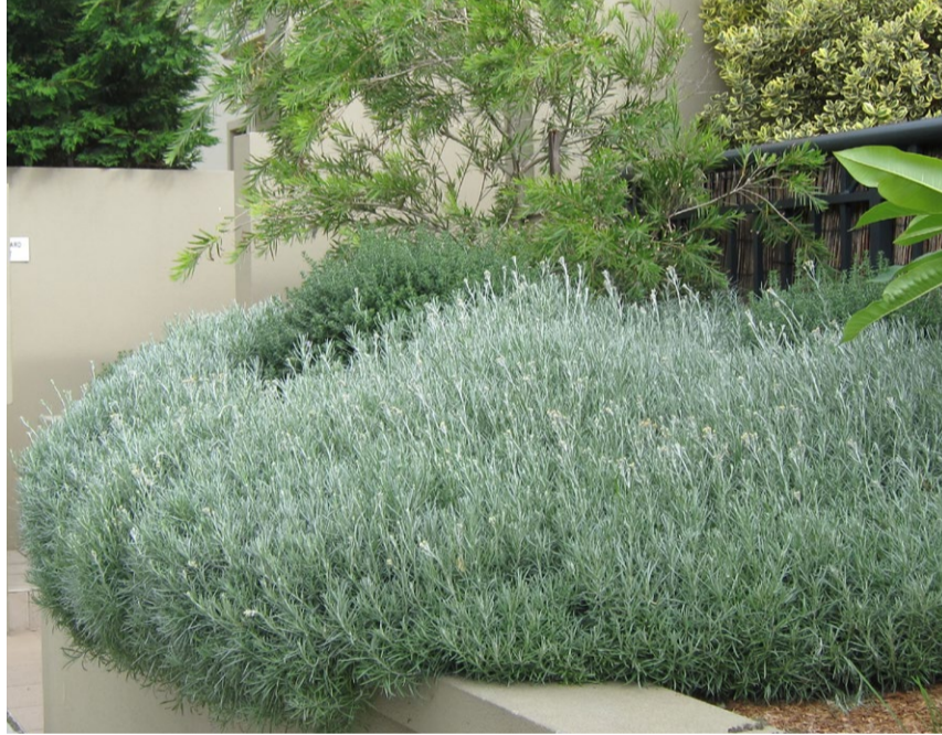
Santolina chamaecyparissus 'Nana' Cotton Lavender