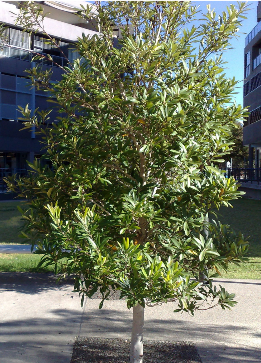
Tristaniopsis laurina luscious Water Gum