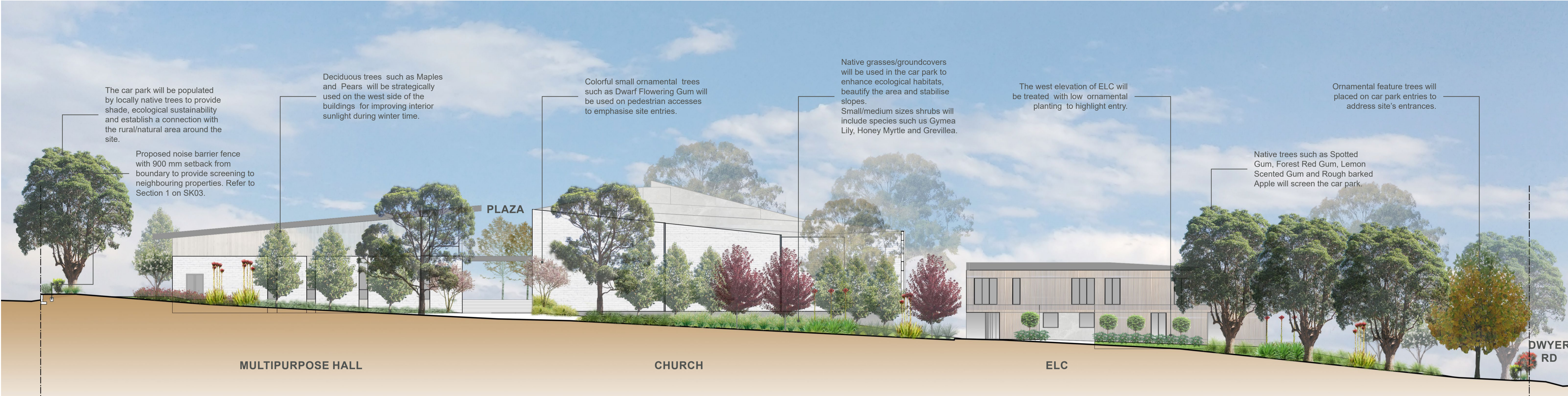
WEST ELEVATION FROM CAR PARK