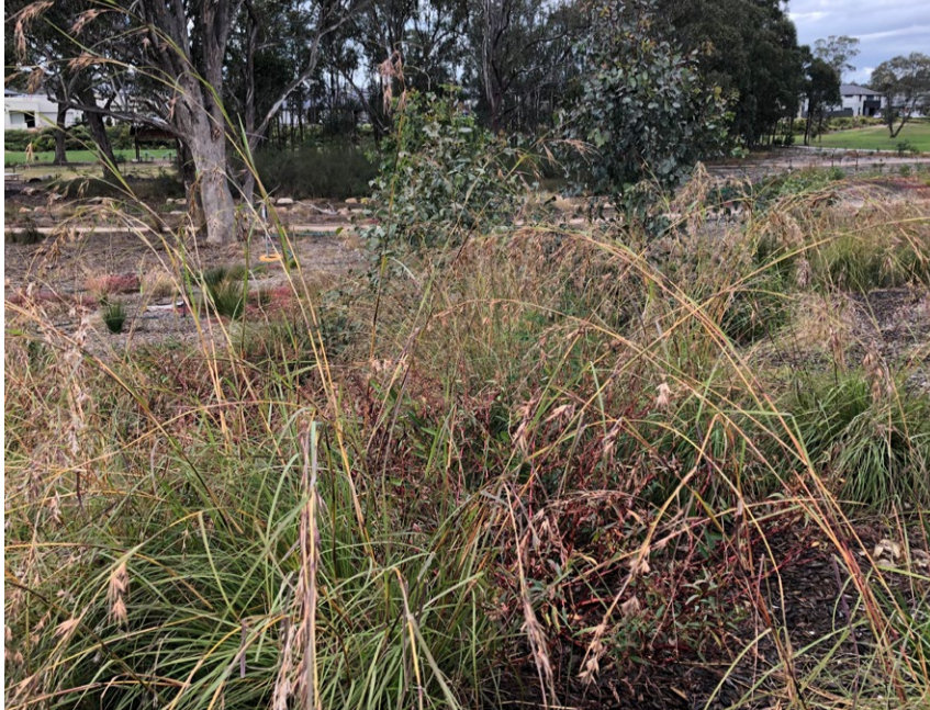
Themeda australis Kangaroo Grass