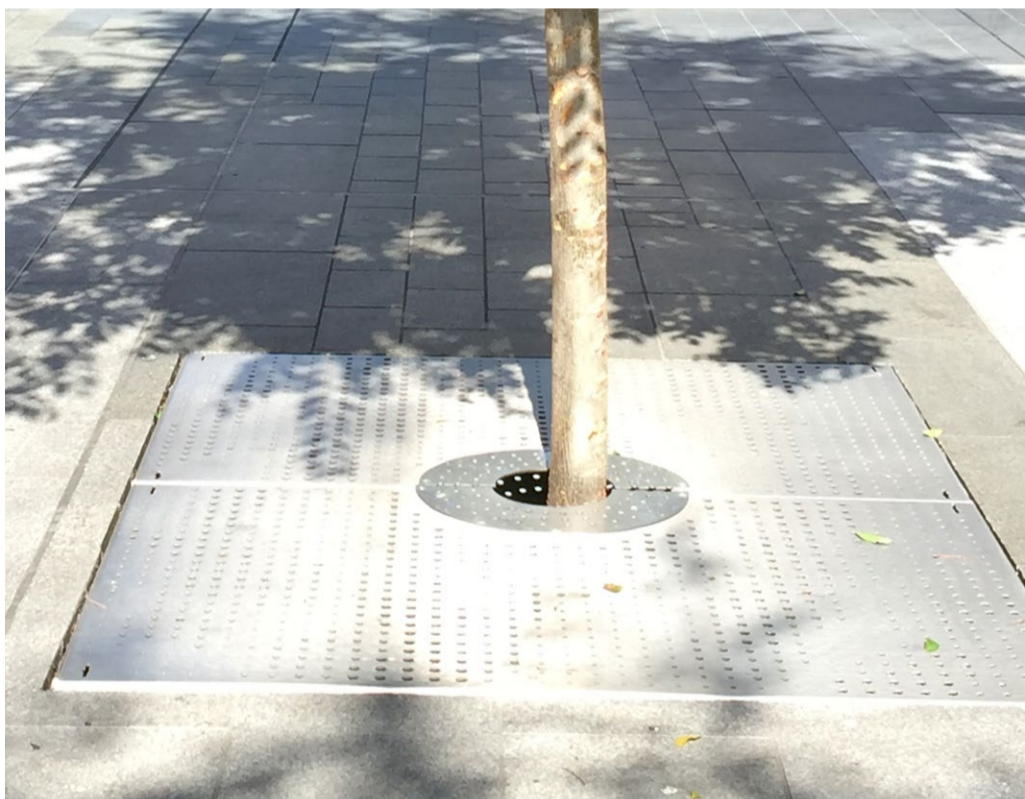
Plaza trees would be placed in tree grates with interpretative opportunities.