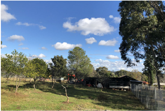
3. View towards existing small fruit orchard.