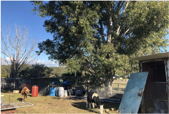
1. View along western boundary at Cabbage Gum over to neighbouring property.