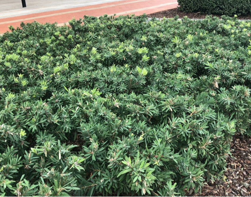
Callistemon 'Green John' Dwarf Bottle Brush