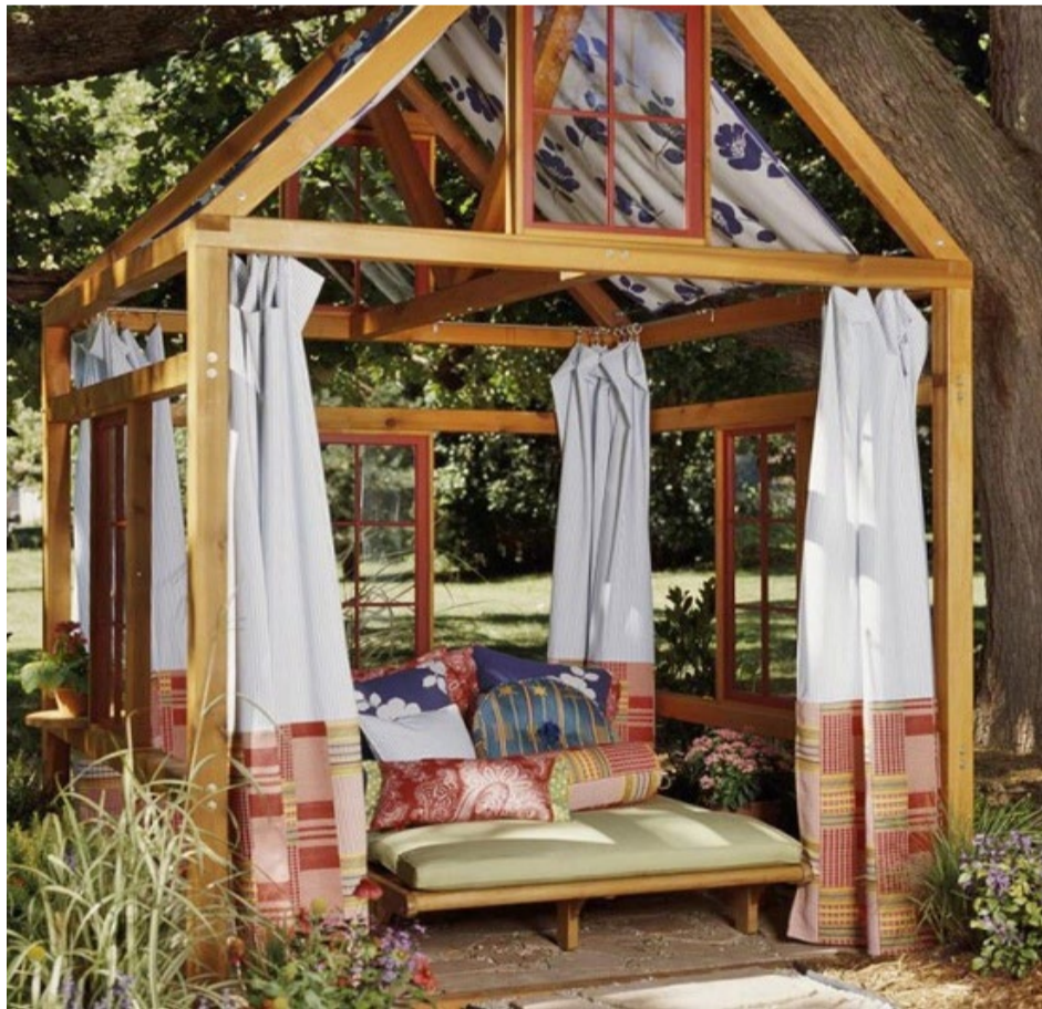
Cubby house can become a playhouse or a retreat