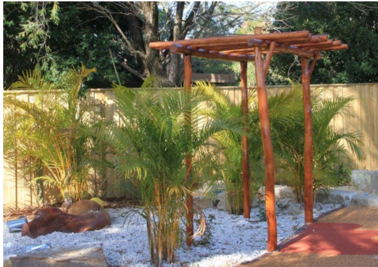
Little pergolas add visual interest as well as provide opportunity to grow climbers