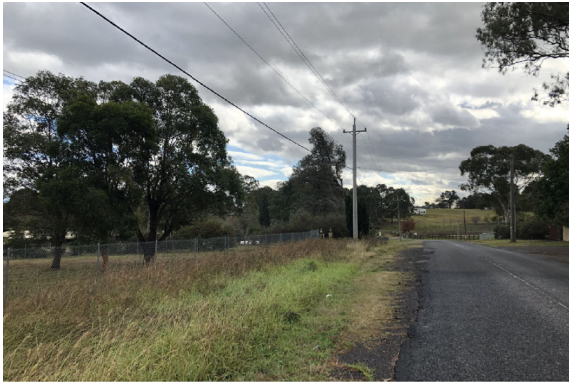
4. Dwyer Road east view.