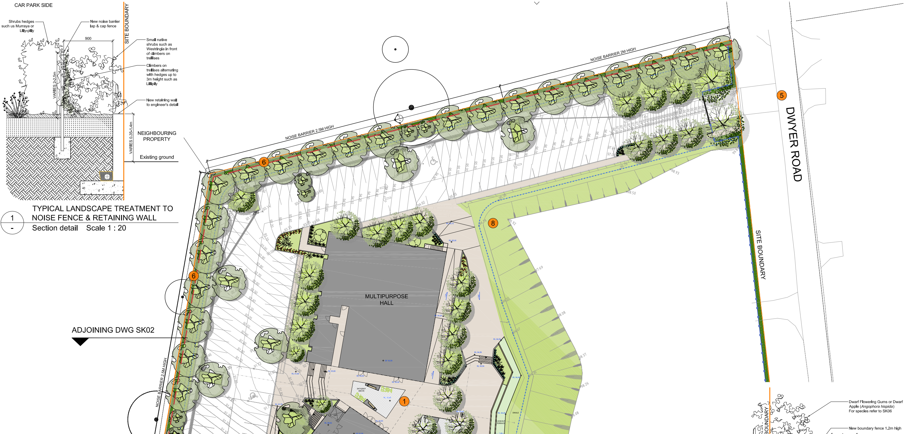
1 - TYPICAL LANDSCAPE TREATMENT TO NOISE FENCE & RETAINING WALL Section detail Scale 1 : 20