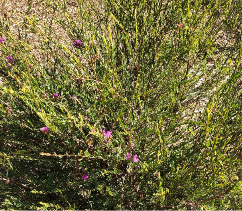
Melaleuca thymifolia 'Purple Lace'