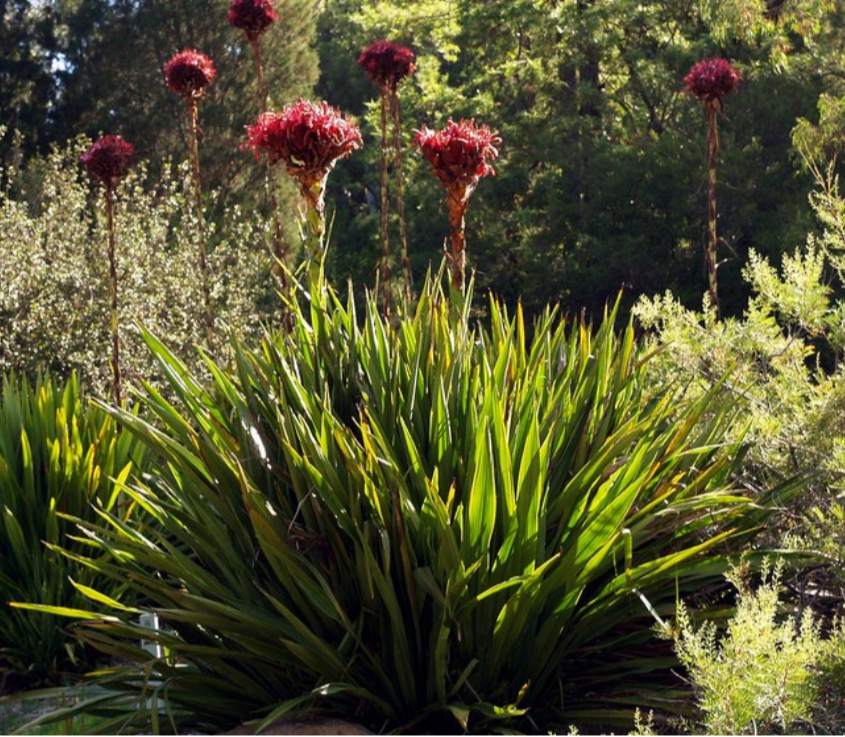
Doryanthes excelsa Gymea Lily