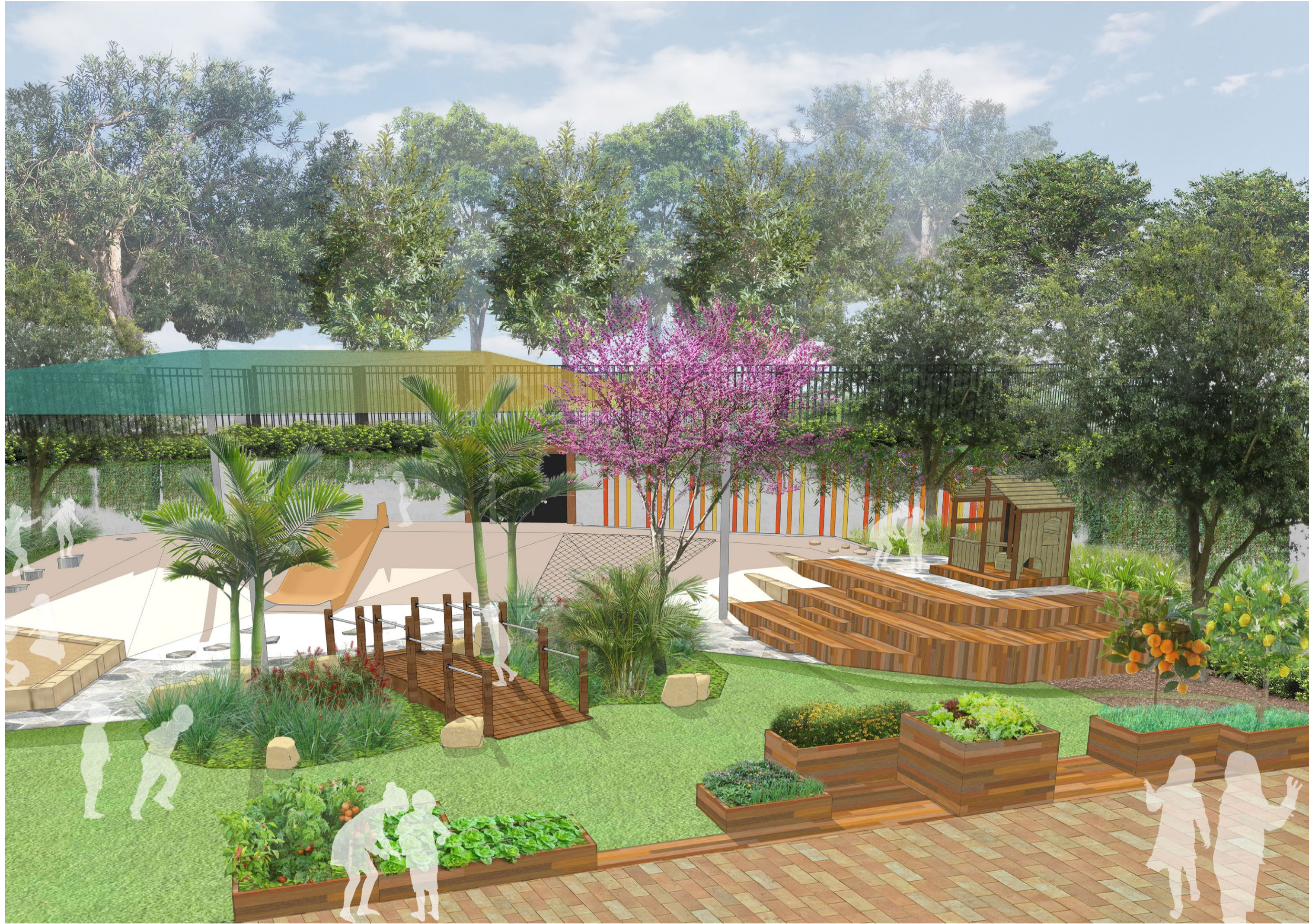
Early Learning Centre outdoor play area. View from the south side