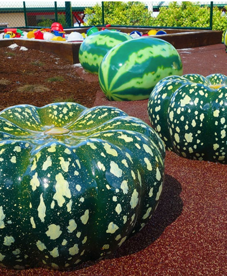
Fun objects and playful elements