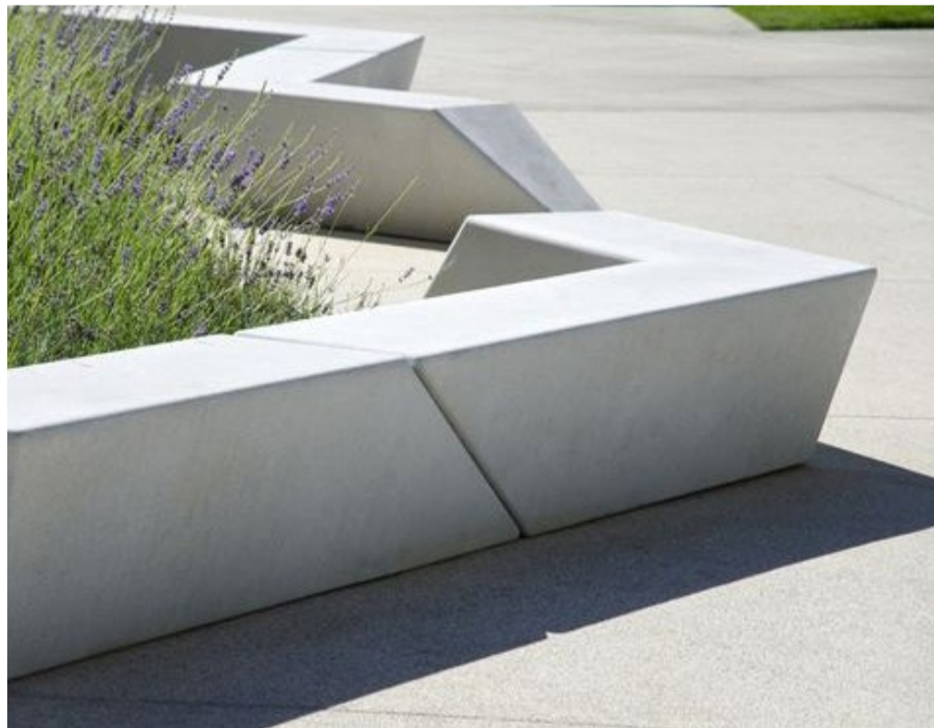
Off form concrete walls will complement architecture.