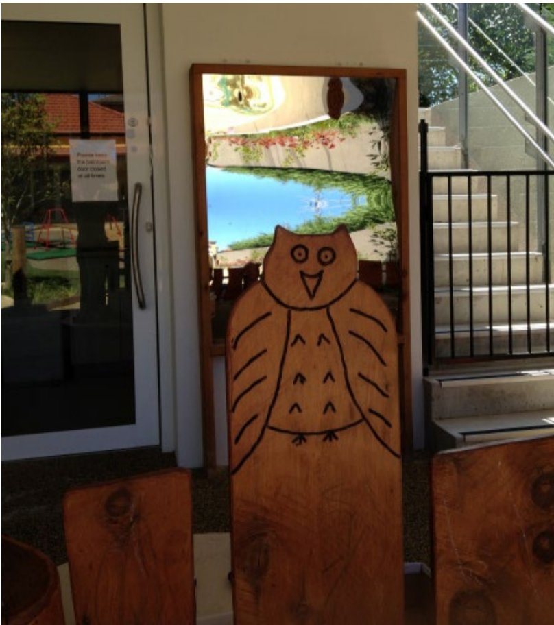
Child friendly elements