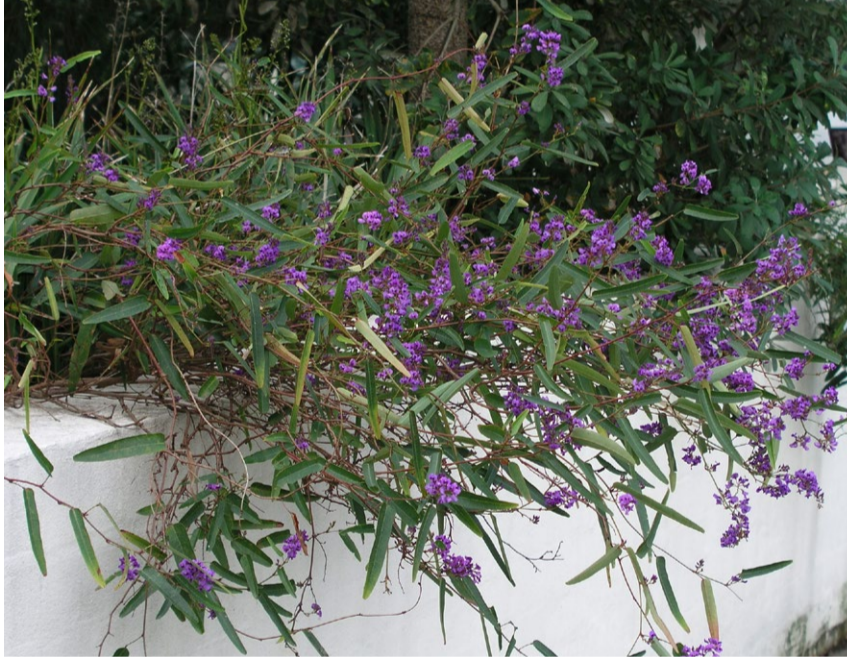
Hardenbergia violacea False Sarsaparila