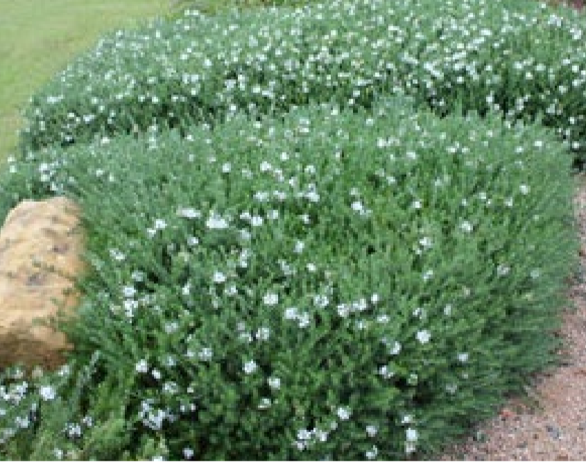
Westringia fruticosa 'Mundi' Dwarf Coastal Rosemary