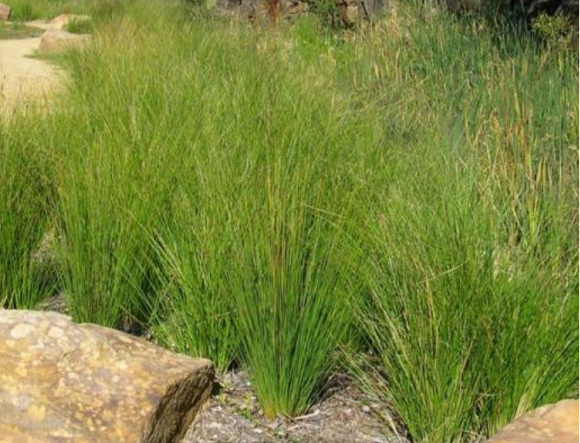
Juncus usitatus Common Rush