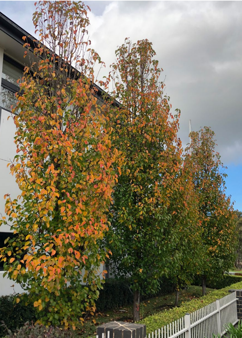
Pyrus calleryana 'Bradford' Bradford Pear Tree