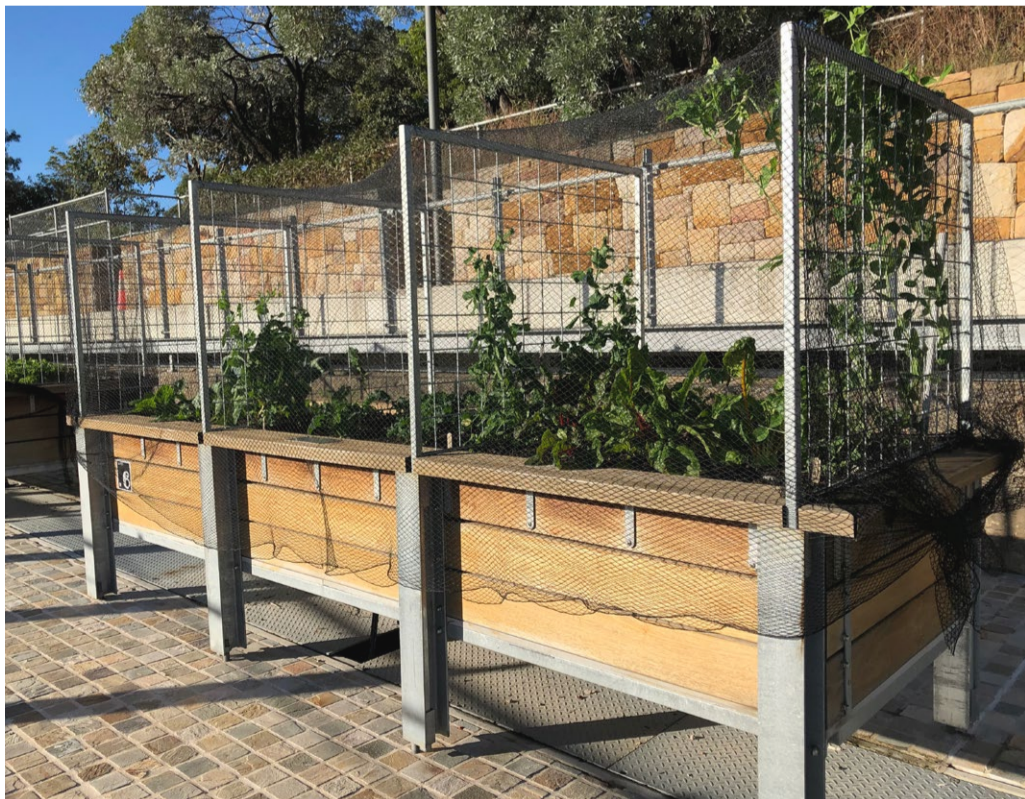
Elevated veggie garden planters can be placed in the community garden.