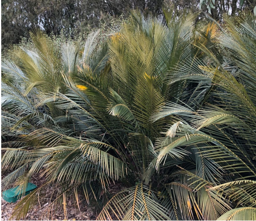
Macrozamia communis Burrawang