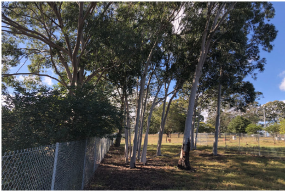
5. View at group of Lemon Scented Gums on the north boundary.