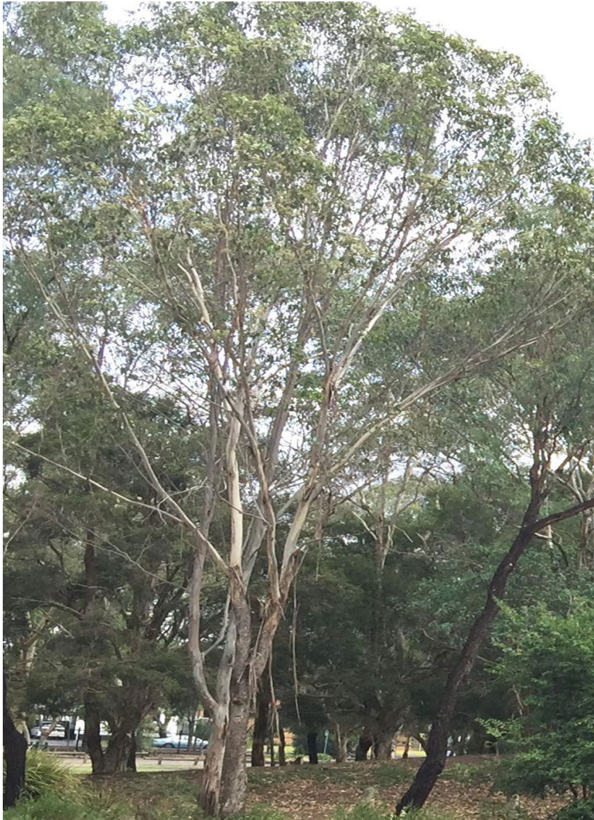
Eucalyptus tereticornis Forest Red Gum