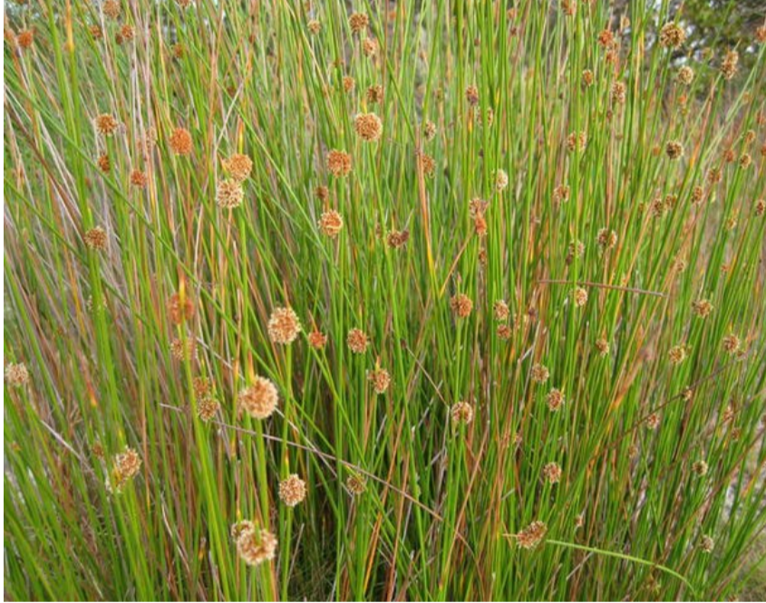
Isolepis nodosa Knobby Club Rush