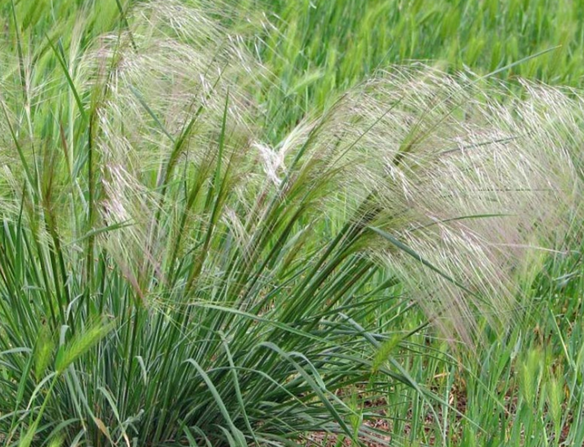
Microlaena stipoides Weeping Grass